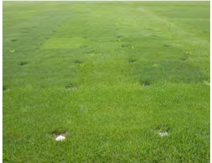
Kentucky Bluegrass cultivar diversity