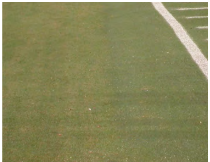
Bermudagrass (Tif-Sport – left; Patriot – right)