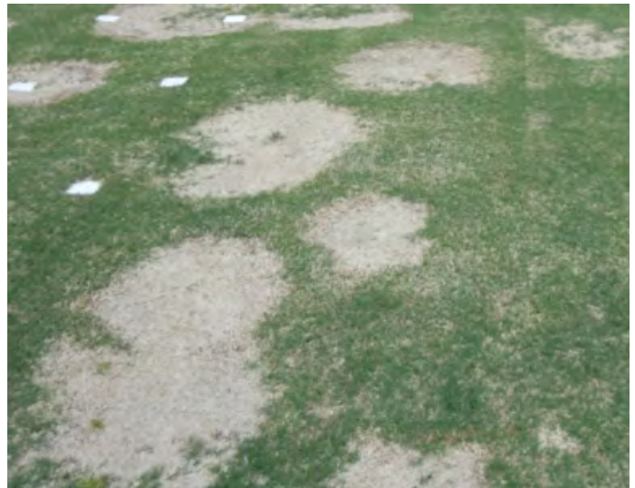
Spring dead spot

If turf blankets are being used, carefully monitor the area for disease. Warm, wet weather during the winter can increase the likelihood for disease appearance. Fungicide applications may be necessary depending on winter weather.