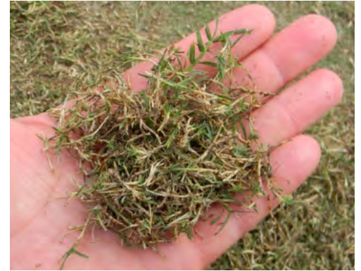
Bermudagrass sprigs - Photo courtesy of Van Cline, Ph.D.)

May is typically the earliest month for successful seeding and sprigging of bermudagrass fields. It is also the best time to repair winter-killed or worn-out areas. Planting in mid to late spring will give the bermudagrass adequate time for establishment so the field can withstand traffic in the fall. Soil cultivation prior to seeding or sprigging will increase seed-to-soil contact and benefit establishment. If the field must be played upon within 8-10 weeks, sod will need to be installed instead.