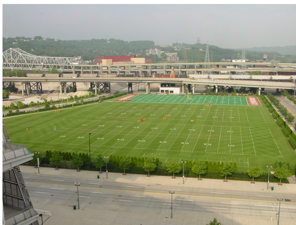
Football practice fields painted East to West.