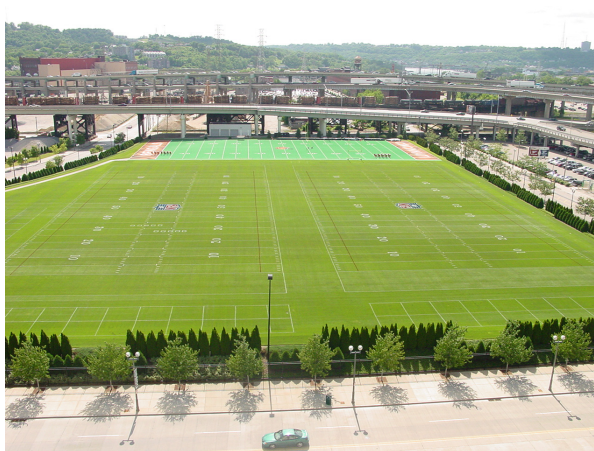
Football practice fields painted North to South.