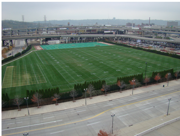
Football practice field layout using less than 100 yd. fields.