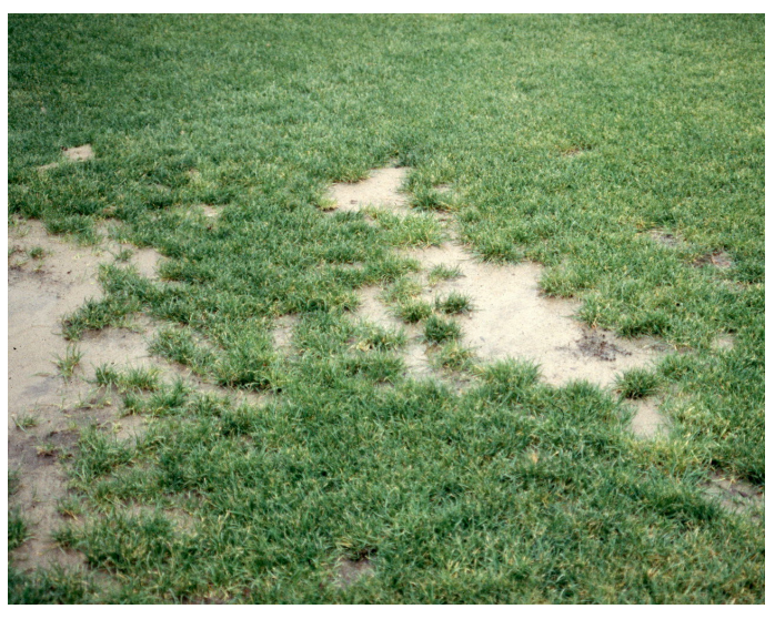
Standing water on an athletic surface

The ease with which water can move through soil is permeability. Infiltration, water entering the soil, and percolation, water moving through the soil, are components of permeability. Infiltration and percolation are measured in inches per hour. Movement of water into and through the soil profile is affected by soil texture, soil structure, and compaction. A field surface is kept free of water most effectively when some water can pass downward though the soil to assist removal by positive surface drainage. If infiltration and percolation are inhibited, water will remain on the surface and rely primarily on surface drainage.