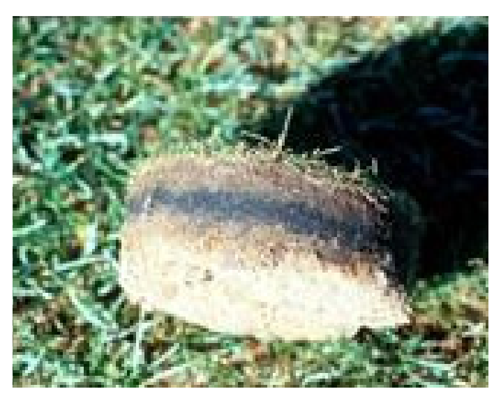
Black Layer - Photo from LSU Ag Centerr

One of the most common problems associated with poor internal drainage is layering within the rootzone. Layering often results from a series of successive cultural practices in which soils of different textures are incorporated into the field. This includes topdressing and/or reincorporating soil cores following hollow tine aeration. As coarsetextured soils are placed over fine-textured soils, or vice versa, a water table can develop. Water tables impede internal drainage by restricting water movement. Fine soil particles over coarse soil particles can cause a perched water table and create a saturated, unstable soil surface. Coarse soil particles over fine soil particles can cause a temporary water table. Depending on weather conditions, a temporary water table can cause the soil surface to dry out quickly. Another problem seen with temporary water tables is the formation of black layer. If the movement of water into the underlying fine layer is prolonged over a long period of time, anaerobic soil conditions can develop and lead to black layer.