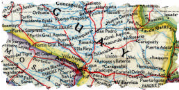
Map: National Geographic Magazine