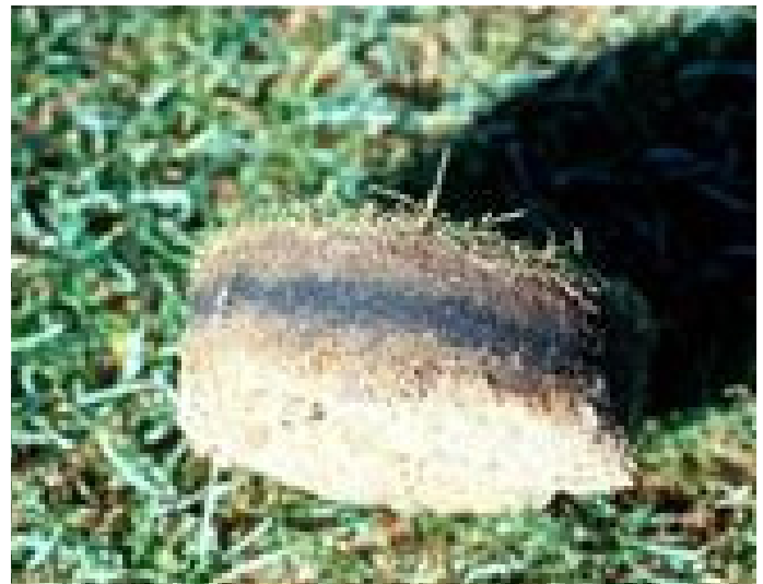
Black Layer

Note: In some cases, addition of soil of a different particle size is desirable. See below for information on amending rootzones.